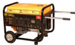
Rental Grade Generators