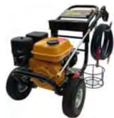
Heavy Duty Pressure Washers