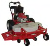
Commercial Lawn Mowers

Other fine products offered by DEK Heavy Duty Power Equipment